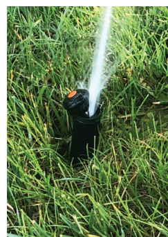
Damaged sprinkler head