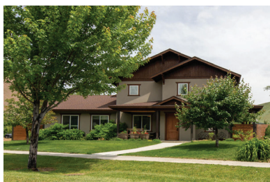
The 520 CD Olena Drive residence recently went on the market.